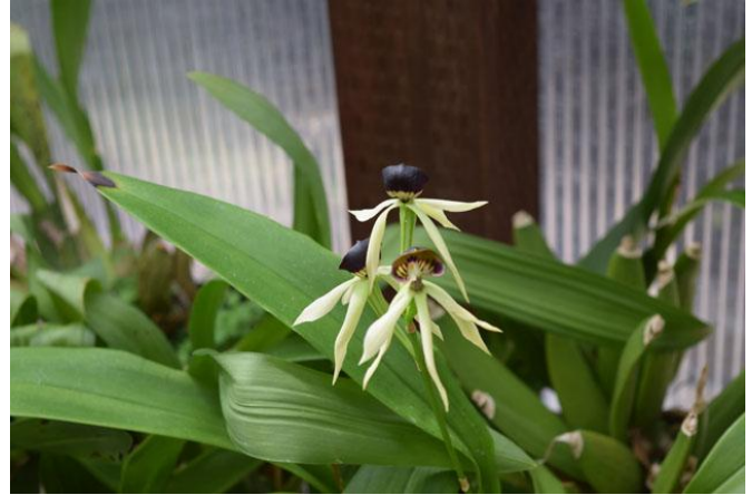
Encyclia Green Hornet

The next SCVOS Board Meeting will be held on July 20, 2016 at a place to be determined .