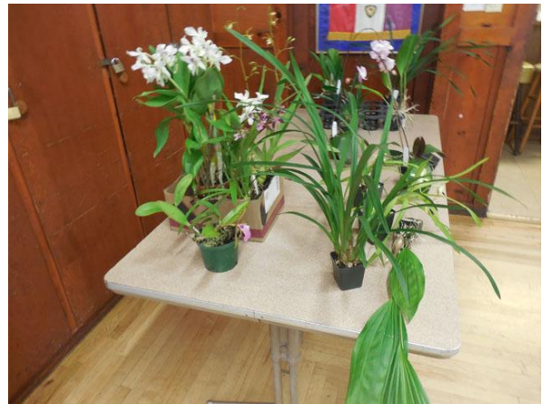
Show & Tell Table I