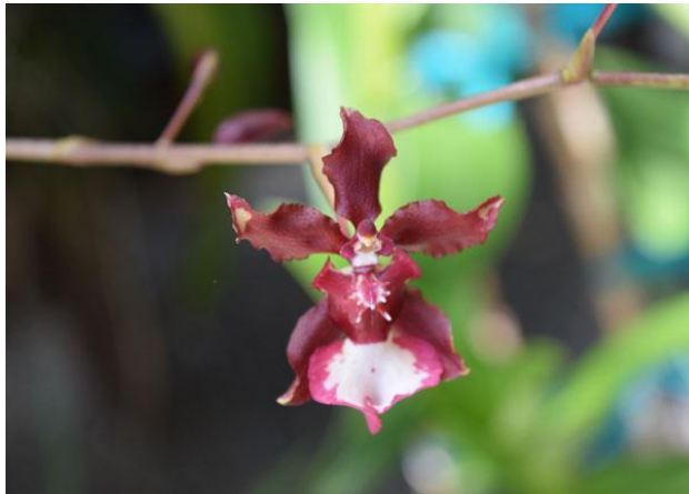
Oncidium Sherry Baby