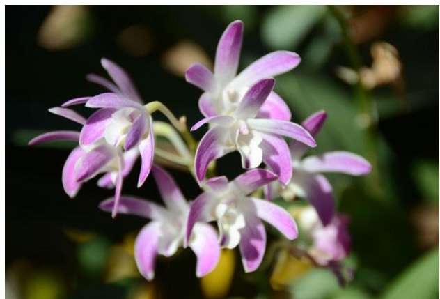
Dendrobium speciosum x kingianum