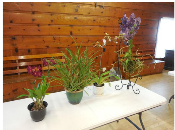
Show & Tell Table II