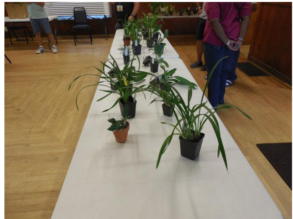
Opportunity Table brought by Dennis