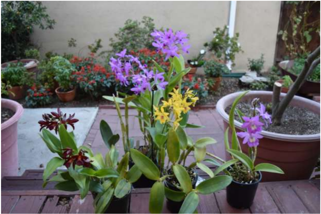
Cattleya hybrids in bloom

SCVOS has acquired and will sell a shop heater ( suitable for a greenhouse) Made by King Mfg. model KGB 2406: 208 volts & up to 5700 watts. Never used, $100.00 OBO.