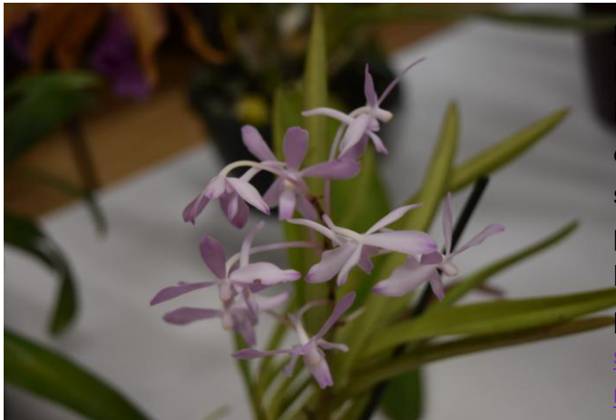
Ascocentrum x Neofinitia