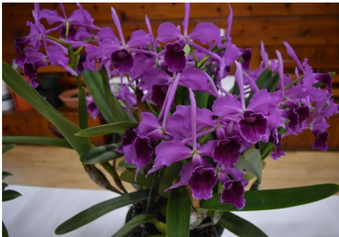
Here is an example Of one of Bill's plants