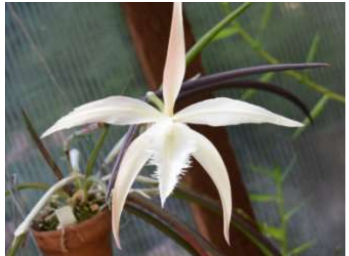
Brassavola cucullata "David Sander"