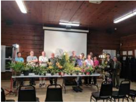
All May Show & Tell Participants