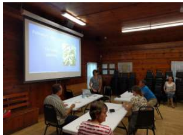
Jeopardy Tournament 2017

We will have our 2nd Annual team Orchid Jeopardy Tournament so study hard, there will be Orchid prizes for the winners.