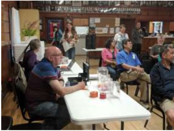
Tom Moss Opportunity Table

Note: We have many free books to loan for beginning growers. They will be available at the Next meeting if you have paid your dues for 2018