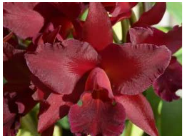
Cattleya Cherry Suisse