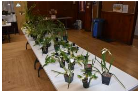
Opportunity Table for February

In this meeting we will again change the order of the drawing for the Opportunity Table. To encourage the purchase of tickets, the first five tickets drawn will be those purchased followed by the member, food, Show& tell & remaining tickets.