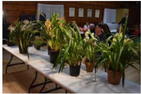
Show & Tell Table