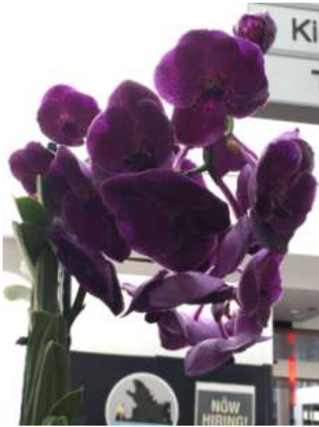
Vanda Pat's Delight