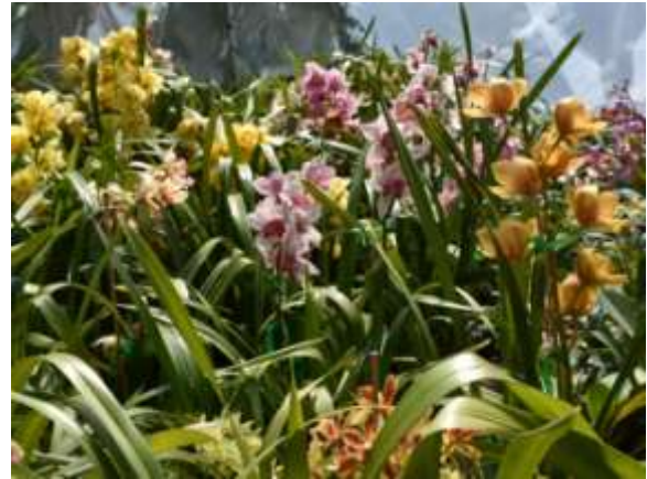
Cymbidiums in bloom