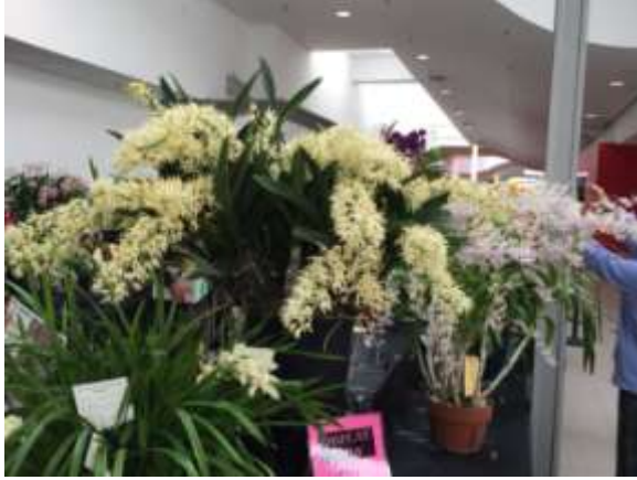
Dend. speciosum Tanya Lam