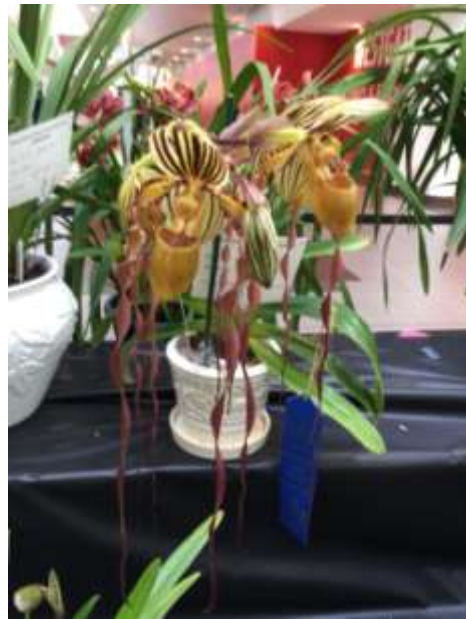
Paph. Michael Koopowitz