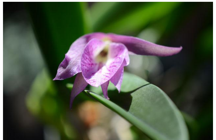
Brassocattleya Maikai Mayami