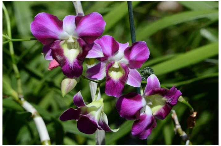
Dendrobium Florence Bousquet