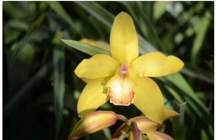
Cymbidium Wattle Creek 'Golden Trail'