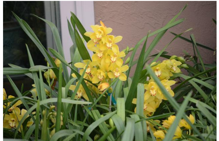
Cymbidium Yellow Moon Sunset