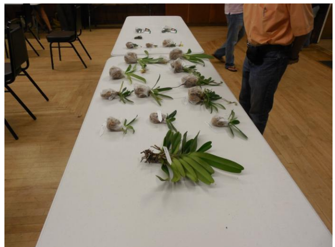
Opportunity table from Holgar