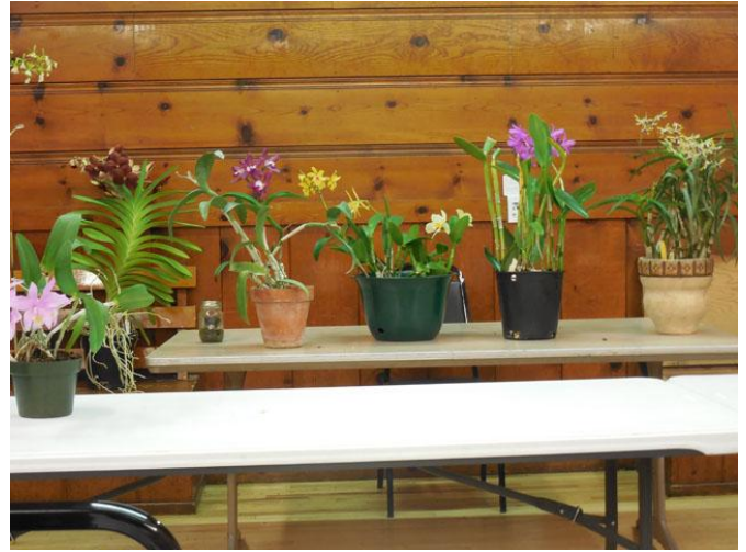
Show & Tell Tables