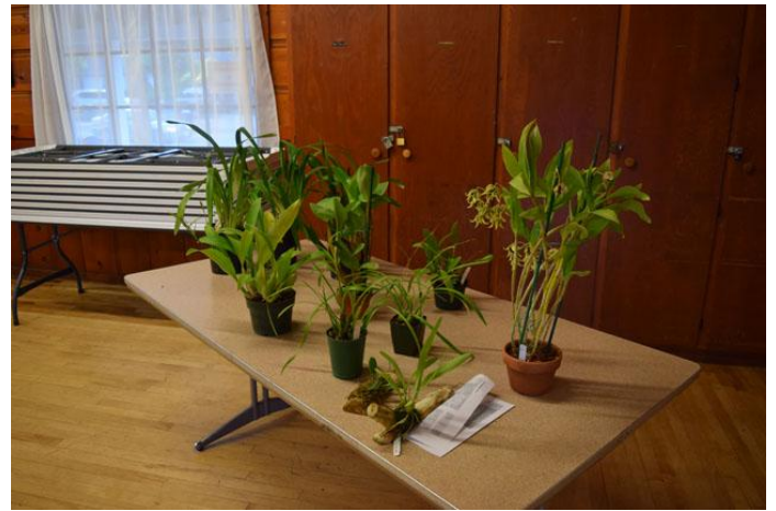
Bingo Prize Orchids

The July Meeting meeting was our Annual BBQ and bingo night. Thanks to all who helped make this a fun evening for all.