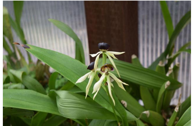
Encyclia Green Hornet

The next SCVOS Board Meeting will be held on August 17th, 2016 at a place to be determined .