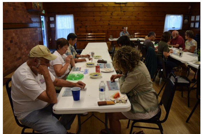
Thanks to all who brought food and purchased Bingo tickets.