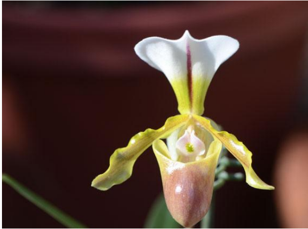
Paphiopedilum Wengduan Sweetheart

NOTES: Remember your 2016 dues are due at the next (January 2016) meeting. $20.00 per year for email . You can also mail your check to: Sally Guan 1524 Rosecrest Terrace San Jose, CA 95126